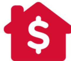
The Financial Industry